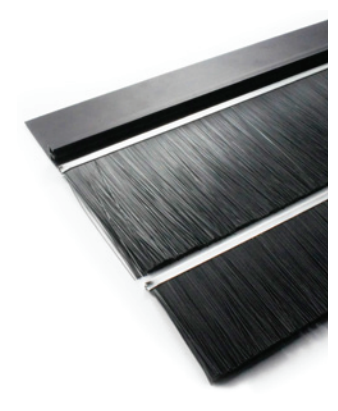
Extended 3" x 24" Brush Grommet Part No. 10012