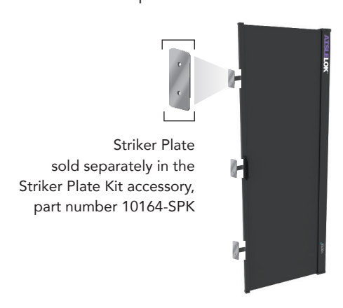
Adjustable Rack Gap Panel